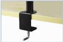
Desk Edge Mounting

Pole x 1 / Mounting Arm x 1 / Clamp x 1 / Hex Key x 2 / Cable Hook x 4 / Rubber Pad x 1 / Spacer x 8 / Cable Clip x 1 / Screw x 35 / Manual x 1