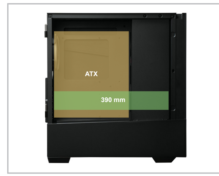
Supports up to ATX Motherboard & 390 mm GPU