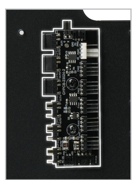
6 Ports ARGB PWM Control Hub