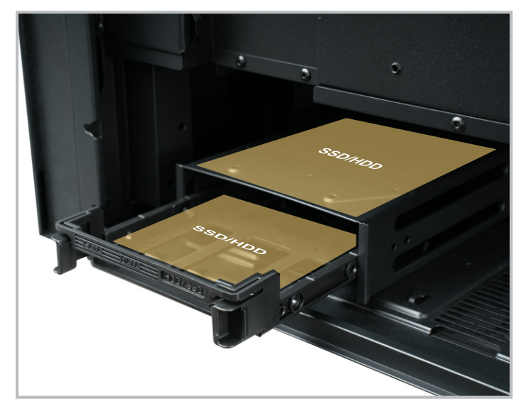
Supports 2 x 3.5" and 2x 2.5" (2 x Converted From 3.5" HDD Cage Drive Bay)