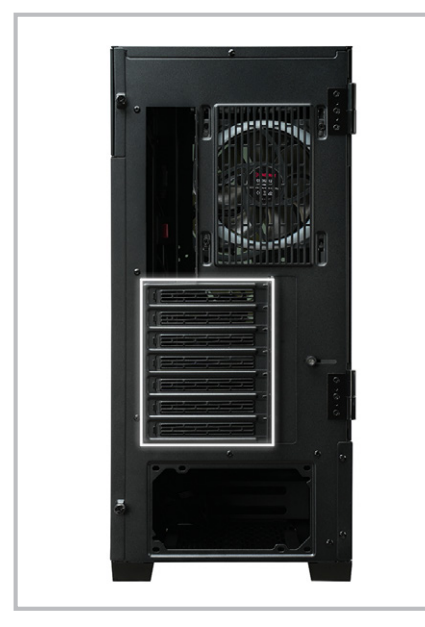
Reusable Expansion Slots