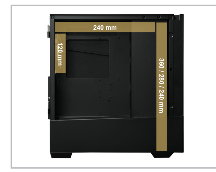
Supports up to 360 AIO