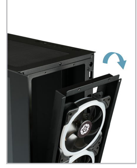
Built-in Fan Bracket