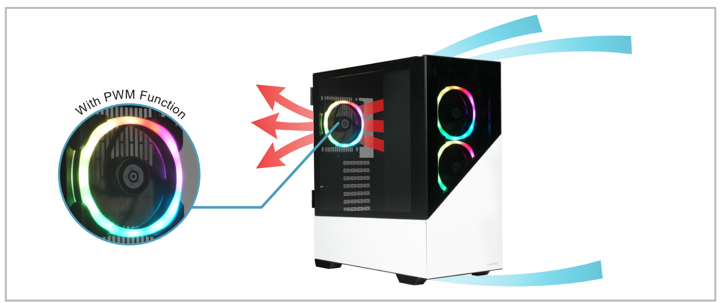
Pre-installed 3 ARGB PWM Fans